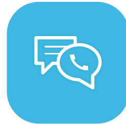
Gogo Text & Talk