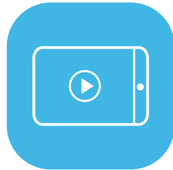
Entertainment & information