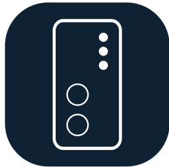
Smart router (802.11ac)