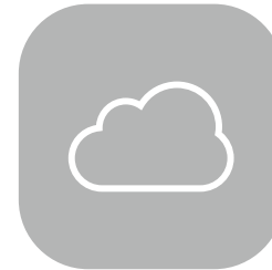
Cloud-based service & support